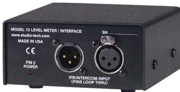
View showing IFB/intercom input and power present LED indicator

Two audio outputs provide transformer-coupled “dry” signals, one output associated with each IFB or intercom channel. These pro-audio-quality outputs are useful for a variety of production and testing applications. For example, the outputs can serve as the interface between a traditional “wet” IFB system and a wireless in-ear monitor or IFB system. The Model 72’s outputs can also be connected to line-level inputs on an audio console, allowing