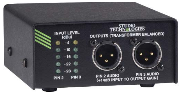
View showing level meters and audio outputs

IFB or intercom audio signals to be combined and/or routed to other local or remote talent or production personnel cue systems. Other applications may arise where an amplified speaker needs to be used to monitor an IFB or intercom circuit. The Model 72’s audio outputs will make achieving this fast and simple.