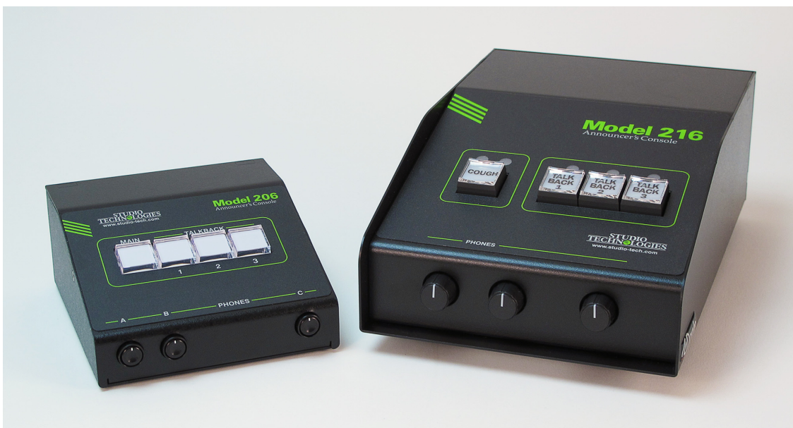
Model 206 Announcer's Console size comparison to Model 216 Announcer's Console

The user is presented with four pushbutton switches and three push-in/push-out rotary level potentiometers. This makes it easy to control the status of the main and talkback outputs as well as adjusting the signals that are sent to the headphone channels.