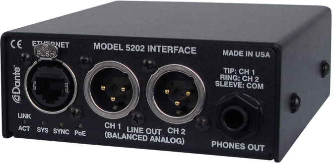
Figure 1. Model 5202 Dante to Phones and Line Output Interface front and rear views