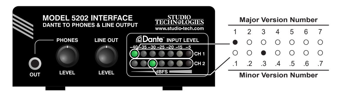
Figure 2. Detail of front panel showing the LEDs that display the firmware version. In this example, the version shown is 1.3.

As previously discussed, upon power up the meter LEDs are used to briefly display the version number of the Model 5202's firmware (embedded software). This information is typically only necessary when working with the factory on support issues. The meter LEDs will first go through a display sequence followed by an approximately 1-second period where the version number will be indicated. The top row of seven LEDs will display the major version number with a range of 1 to 7. The bottom row of seven LEDs will display the minor version number with a range of 1 to 7. Refer to Figure 2 for details.