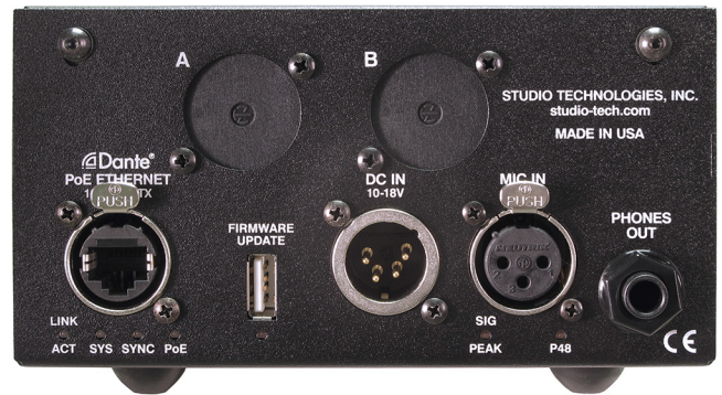
Figure 1. Model 214A Announcer's Console front and back views

power is provided and meets the worldwide P48 standard. A dual-color LED indicator serves as an optimization aid when setting the gain of the microphone preamplifier.