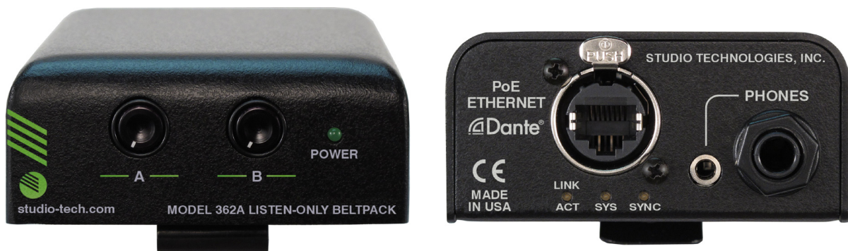
Figure 1. Model 362A Listen-Only Beltpack top and bottom views

Two push-in/push-out rotary controls ("pots") make it easy for the user to set and maintain the desired level on the 2-channel headphone output. Four LEDs provide a clear and complete indication of the unit's operating status. The Model 362A's enclosure is made from an aluminum alloy which offers both ruggedness and light weight. A stainless steel "belt clip," located on the back of the unit, allows direct attachment to a user's clothing.