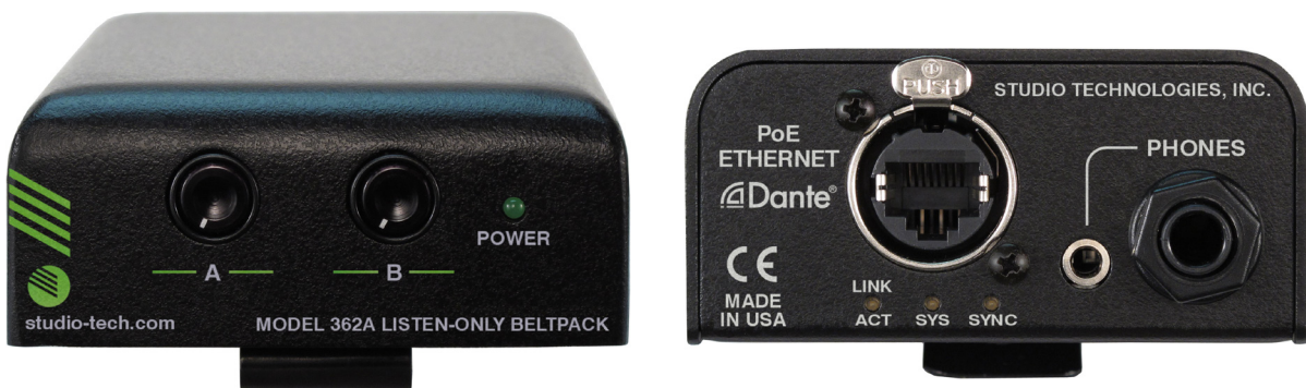
Figure 1. Model 362A Listen-Only Beltpack top and bottom views

Two push-in/push-out rotary controls ("pots") make it easy for the user to set and maintain the desired level on the 2-channel headphone output. Four LEDs provide a clear and complete indication of the unit's operating status. The Model 362A's enclosure is made from an aluminum alloy which offers both ruggedness and light weight. A stainless steel "belt clip," located on the back of the unit, allows direct attachment to a user's clothing.