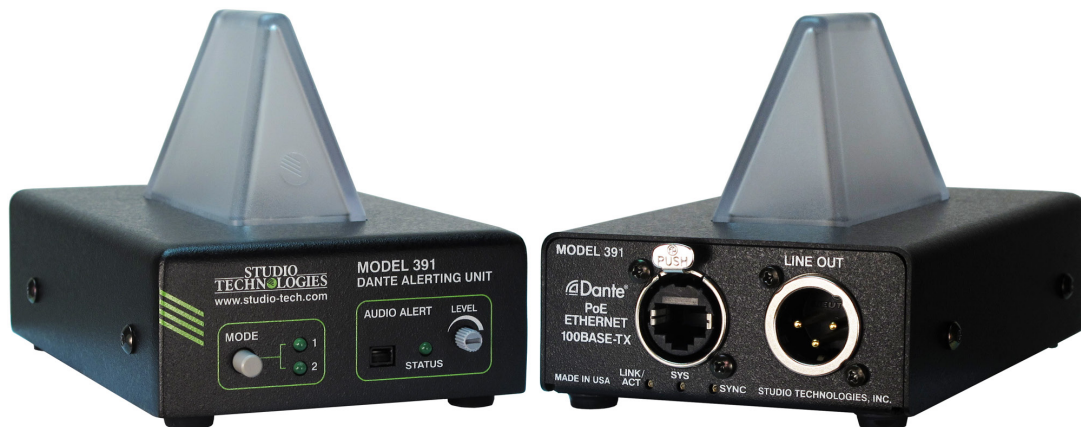
Figure 1. Model 391 Dante Alerting Unit front and back views

The Model 391 can also be used as a general-purpose status indicator for various live-event applications. Instead of responding to intercom call signals, the STcontroller application can be used to select the