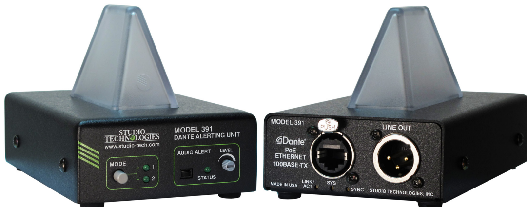
Figure 1. Model 391 Dante Alerting Unit front and back views

The Model 391 can also be used as a general-purpose status indicator for various live-event applications. Instead of responding to intercom call signals, the STcontroller application can be used to select the