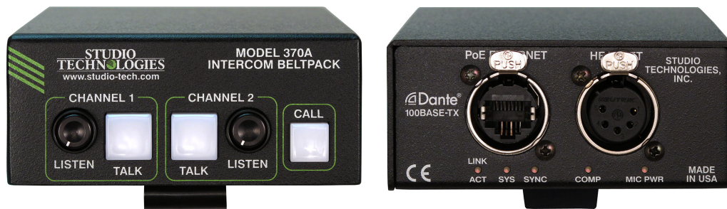
Figure 1. Model 370A Intercom Beltpack top and bottom views

Two bi-color LEDs provide an indication of the Dante connection status. The Dante Controller's Identify command takes on a unique role with the Model 370A. Not only will it cause the talk and call button LEDs to light in a unique highly visible sequence, it can also be configured to turn off any active talk channels.