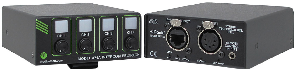
Figure 1. Model 374A Intercom Beltpack top and bottom views

The STcontroller software application is used to select the unit's operating parameters. Four talk pushbutton switches can be configured for optimal operation. Four push-in/push-out (“pop out”) rotary controls make it easy to set and maintain the desired headphone output level. The Model 374A's enclosure is made from an aluminum alloy which offers both light weight