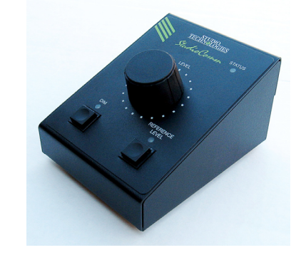
Model 71 Control Console

The Model 76DA occupies one space (1U) in a standard 19-inch rack. Digital audio sources are interfaced with the Model 76DA using nine BNC connectors. A tenth BNC connector is used by the sync source. Digital and analog monitor output signal connections are made using two 25-pin D-subminiature connectors. One 9-pin D-subminiature connector