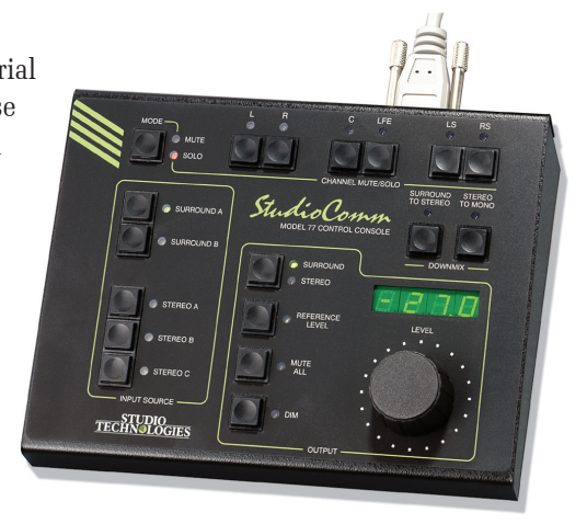
Model 77 Control Console

A StudioComm for Surround system starts with the Model 77 Control Console. It's the system's "command center" and is designed to reside at an operator's location, allowing fingertip selection of all monitoring functions. Numerous LED indicators provide complete status information. A 4-digit numeric display indicates the post-fader monitor output level in real time. A major strength of the Model 77 is its ability to configure, under software control, many important