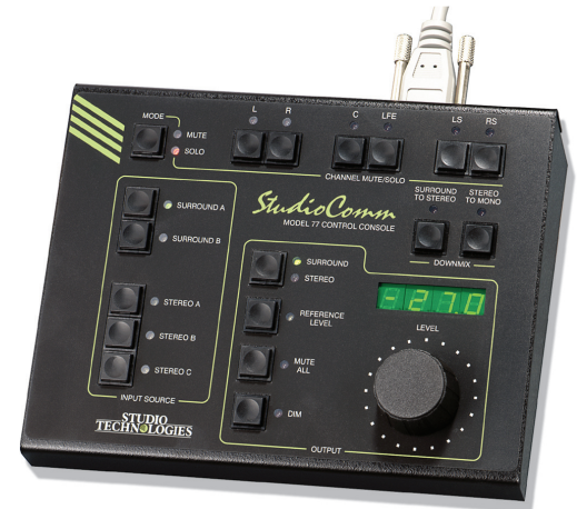
Model 77 Control Console

The core of this StudioComm for Surround system is the Model 76D Central Controller. The one-rack-space unit contains circuitry that supports digital audio inputs, digital monitor outputs, processing, and the user interface. The Model 76D provides two surround (5.1) and three stereo digital audio inputs. These unbalanced digital inputs are AES3id/SMPTE 276M-compliant; sources of this type are ubiquitous in most post-production and broadcast environments. The inputs allow a sample rate of up to 192 kHz and a bit depth of up to 24 to be directly supported. Circuitry associated with one of the stereo inputs provides sample rate conversion (SRC) capability, allowing a wide range of digital audio sources to be monitored. Up to 340 milliseconds of input delay can be selected to compensate for processing delays in an associated video path. For flexibility, two delay values can be configured, allowing real-time selection as desired. A number of different signals can serve as the Model 76D's digital audio timing reference. For synchronization with a master timing reference a dedicated source of word clock, DARS (AES11), bi-level video, or tri-level video can be connected. Alternately, the L/R connection of the actively selected surround or stereo input source can serve as the timing reference.