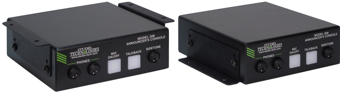
MBK-02 Mounting Brackets shown in Bottom-Mount (left) and Top-Mount (right) Positions