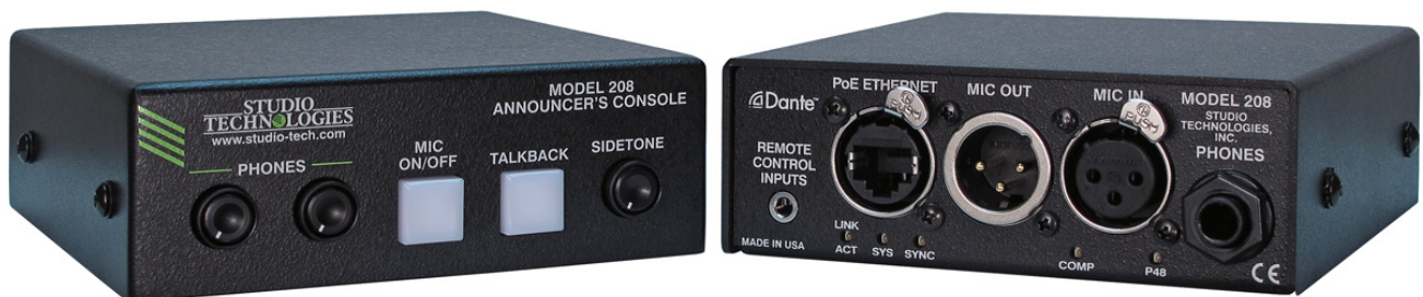
Figure 1. Model 208 Announcer's Console front and rear views

The Model 208 on its own can provide an “all-Dante” solution for one on-air talent location. A wide range of applications can be supported, including sports and entertainment TV and radio events, streaming broadcasts, corporate and government AV installations, and post-production facilities. Two Dante receiver (audio input) channels supply the user with their talent cue (IFB) signals. Should the cue signal be “mix-minus” an integrated sidetone function can provide the user with a microphone confidence signal. Two Dante audio output channels, one designated as main (for on-air) and the other talkback, are routed via an associated local-area network (LAN) to inputs on Dante-compatible devices.