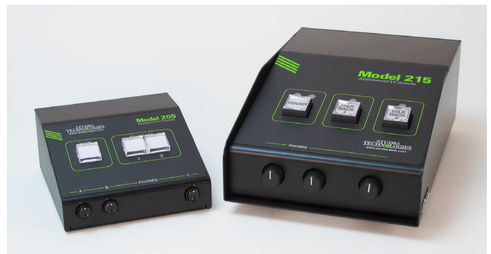
Model 205 Announcer's Console size comparison to Model 215 Announcer's Console

Audio data is sent to and received from the Model 205 using the Dante audio-over-Ethernet media networking technology. As a Dante-compliant device, the Model 205's three Dante transmitter (output) channels and four Dante receiver (input) channels can be assigned (routed or "subscribed") to other devices using the Dante Controller software application. The Dante transmitter (output) and receiver (input) channels are limited to supporting four Dante flows, two in each direction. The digital audio's bit depth is up to 24 with a sampling rate of 44.1 or 48 kHz. Two bi-color LEDs provide an indication of the Dante connection status. An additional LED displays the status of the associated Ethernet connection.