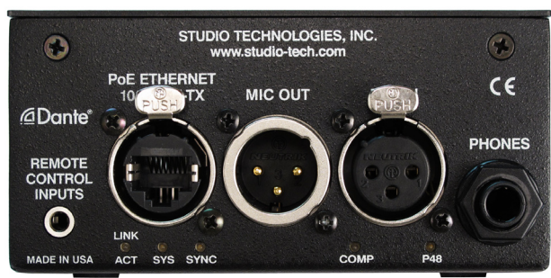
Figure 1. Model 206 Announcer's Console front and rear views