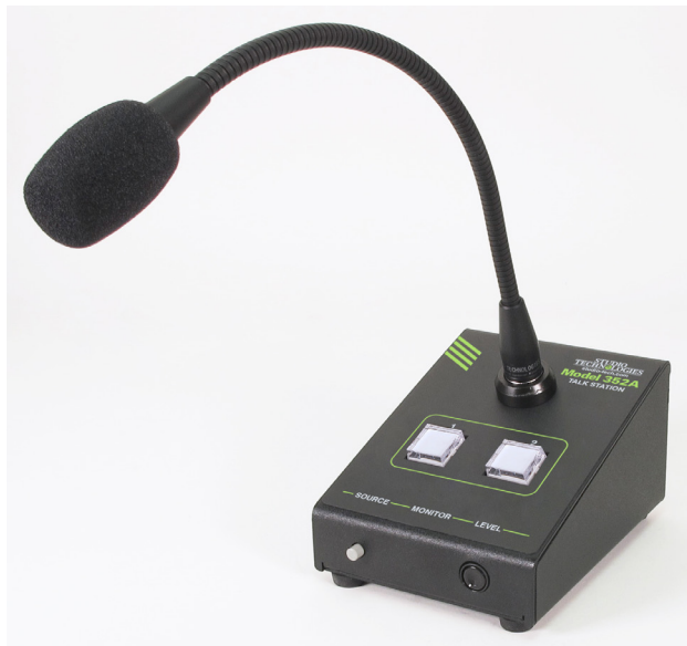
Figure 2. Model 352A Talk Station shown with optional GME-3-12 Gooseneck Microphone

The unit could be conveniently located in a box office, manager's office, or back stage location.