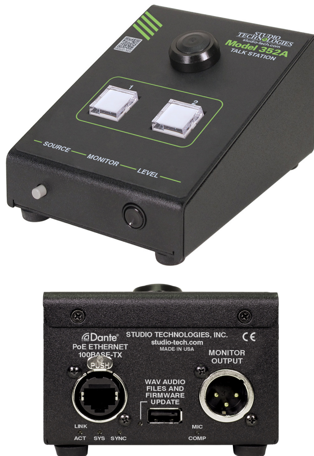
Figure 1. Model 352A Talk Station front and back views

Model 352A operating features are configured using the STcontroller software application. An extensive set