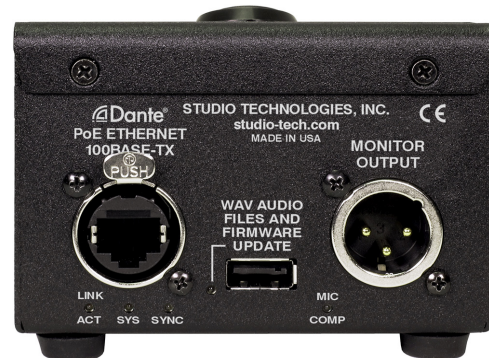
Figure 1. Model 352A Talk Station front and back views

of parameters allows the unit’s functions to be tailored to meet the needs of a myriad of applications. STcontroller is a fast and simple means of confirming and revising the unit’s operating parameters. The Model 352A is housed in a compact, rugged steel enclosure that’s intended for table-top use. Its small size makes it ideal for applications in space-constrained locations.