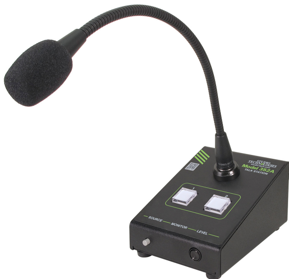
Figure 2. Model 352A Talk Station shown with optional GME-3-12 Gooseneck Microphone

The unit could be conveniently located in a box office, manager's office, or back stage location.