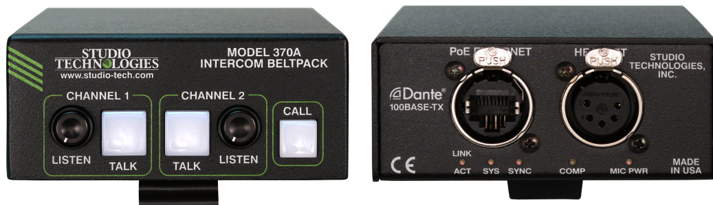
Figure 1. Model 370A Intercom Beltpack top and bottom views

The audio quality of the Model 370A’s audio channels is excellent, with low distortion, low noise, and high headroom. Careful circuit design and rugged components ensure long, reliable operation. A wide range of applications can be supported, including sports and entertainment TV and radio events, streaming broadcasts, corporate and government AV installations, and post-production facilities.