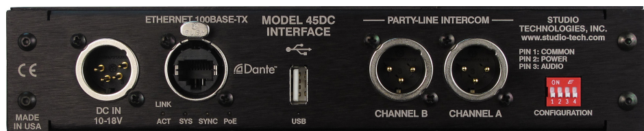
Figure 2. Model 45DC back view