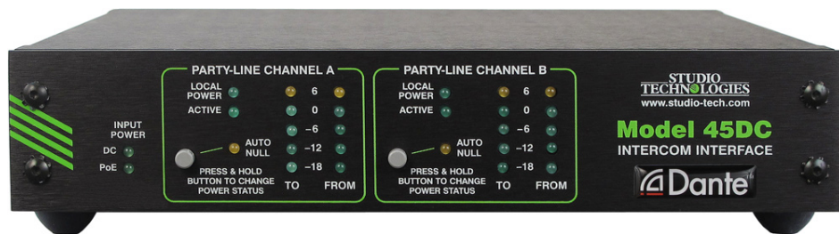
Figure 1. Model 45DC standard “throw-down” front view

A Model 45DC can interconnect with devices such as matrix intercom systems, DSP processors, and audio consoles. The Model 45DC is directly compatible with the RTS ADAM® OMNEO® matrix intercom network. Alternately, two Model 45DC units can interconnect by way of the associated Ethernet network. The Model 45DC can be powered by Power-over-Ethernet (PoE) or an external source of 12 volts DC. Two party-line power sources with impedance termination networks can be supplied by the Model 45DC, allowing connection of two sets of user belt-packs such as the Clear-Com RS-501 and RS-701. A Model 45DC