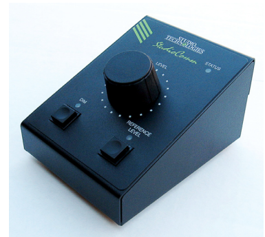
Model 71 Control Console

The Model 76DA occupies one space (1U) in a standard 19-inch rack. Digital audio sources are interfaced with the Model 76DA using nine BNC connectors. A tenth BNC connector is used by the sync source. Digital and analog monitor output signal connections are made using two 25-pin D-subminiature connectors. One 9-pin D-subminiature connector is used to connect the Model 76DA with up to four Model 77 or Model 71 Control Consoles. A second 9-pin "D-sub" connector is used to interface with remote control signals. AC mains power is connected directly to the Model 76DA, with an acceptable range of 100 to 230 volts, 50/60 Hz.