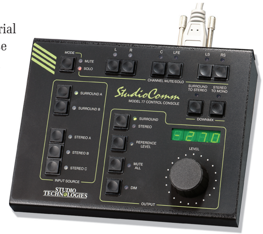
Model 77 Control Console

The core of this StudioComm for Surround system is the Model 76DA Central Controller. The one-rack-space unit contains circuitry that supports digital audio inputs, digital and analog monitor outputs, processing, and the user interface. The Model 76DA provides two surround (5.1) and three stereo digital audio inputs. These unbalanced digital inputs are AES3id/SMPTE 276M-compliant; sources of this type are ubiquitous in most post-production and broadcast environments. The inputs allow a sample rate of up to 192 kHz and a bit depth of up to 24 to be directly supported. Circuitry associated with one of the stereo inputs provides sample rate conversion (SRC) capability, allowing a wide range of digital audio sources to be monitored. Up to 340 milliseconds of input delay can be selected to compensate for processing delays in an associated video path. For flexibility, two delay values can be configured, allowing real-time selection as desired. A number of different signals can serve as the Model