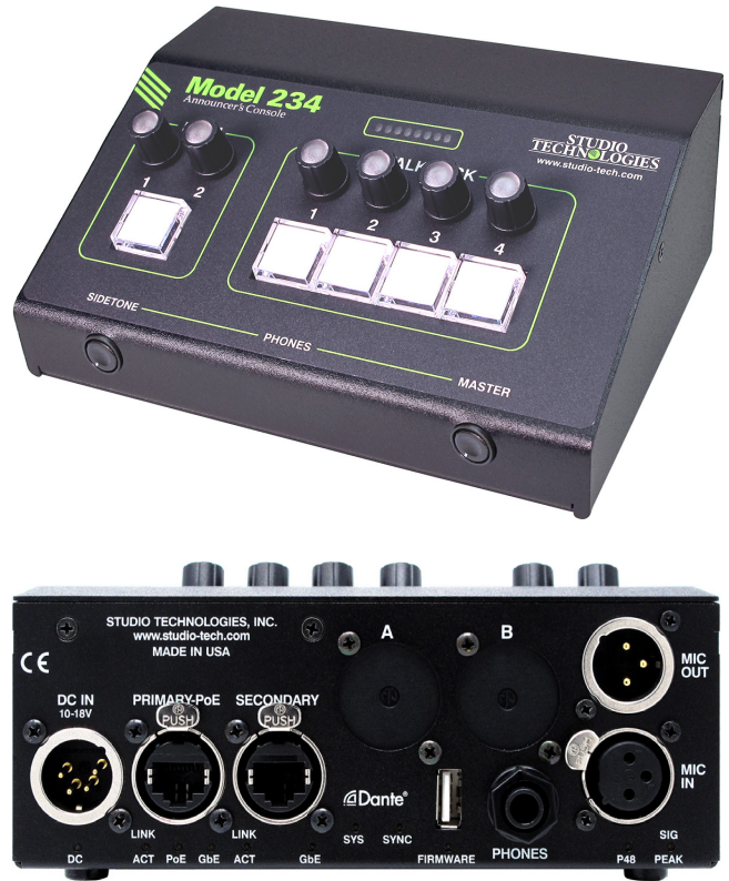
Figure 1. Model 234 Announcer's Console front and back views

The Model 234 was designed to meet two main goals: supporting great audio quality and providing an extensive set of configurable features. Using the latest in audio integrated circuits and advanced 32-bit audio processing, the unit's audio performance should meet or exceed that of any audio console, standalone microphone preamplifier, remote I/O interface, or outboard A/D or D/A converter. With over 40 years of professional audio experience, Studio Technologies takes audio performance seriously! And while providing excellent technical specifications is a "must," a device also has to "sound" good before we feel its design is complete.