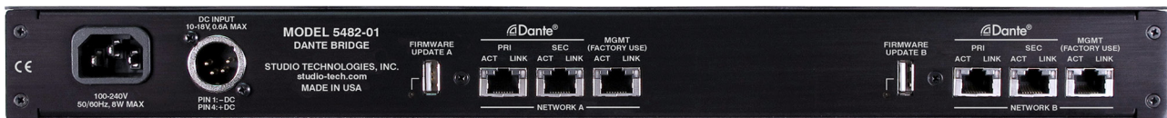
Figure 2. Model 5482-01 Dante Bridge back view

The Model 5482 can also find use within a single Dante network. The unit's ability to link Dante audio channels that have different clocking, bit depth, and sample rate characteristics can be valuable. For example, one piece of equipment may only support a sample rate of 96 kHz, while the other devices connected to the network only support 48 kHz. In this situation, the Model 5482-01 would allow the interconnection of 16 channels in each direction, while still maintaining the required 96 kHz and 48 kHz sample rates. (The Model 5482-02 would allow 32 channels.) In this application, it's interesting to note that the Model 5482's Dante Ethernet ports would be connected to the same local-area-network (LAN).