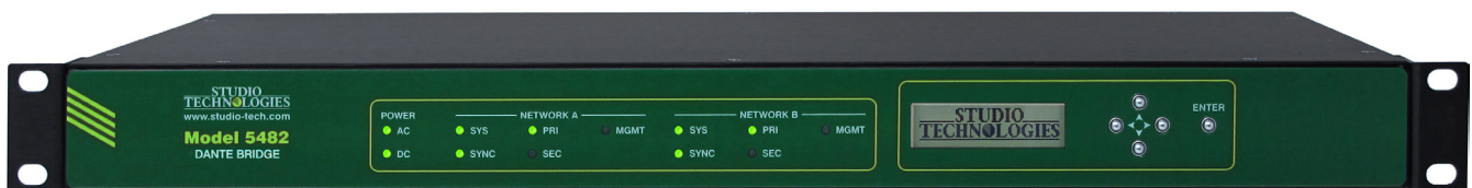
Figure 1. Model 5482 Dante Bridge front view

Sample rate converter (SRC) functionality is implemented within field-programmable gate array (FPGA) programmable logic. This resource ensures