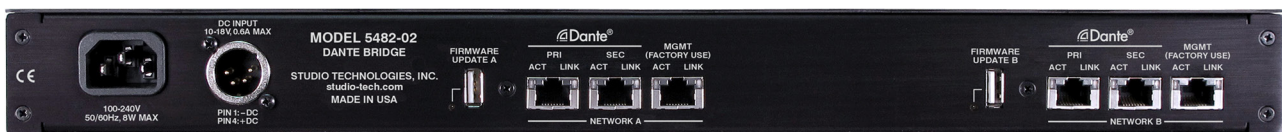
Figure 3. Model 5482-02 Dante Bridge back view