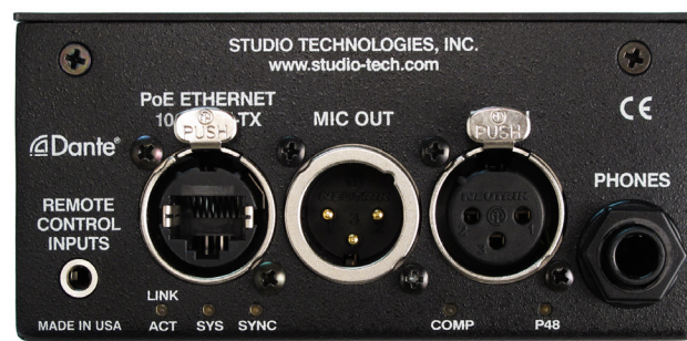
Figure 1. Model 206 Announcer's Console front and rear views