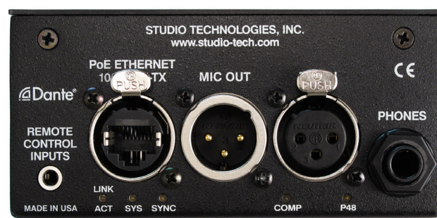
Figure 1. Model 206 Announcer's Console front and rear views