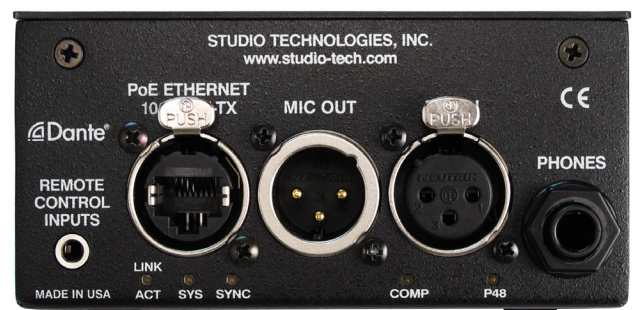
Figure 1. Model 204 Announcer's Console front and rear views