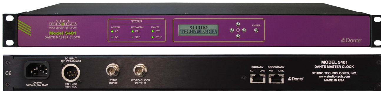
Figure 1. Model 5401 Dante Master Clock front and back views

Applications for the Model 5401 include broadcast facilities, college and university audio networks, arenas, stadiums, and corporate installations — virtually any application where substantial numbers of Dante-compatible devices are utilized. The Model 5401 will serve as a stable and