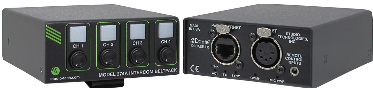
Figure 1. Model 374A Intercom Beltpack top and bottom views

The STcontroller software application is used to select the unit's operating parameters. Four talk pushbutton switches can be configured for optimal operation. Four push-in/push-out (“pop out”) rotary controls make it easy to set and maintain the desired headphone output level. The Model 374A's enclosure is made from an aluminum alloy which offers both light weight