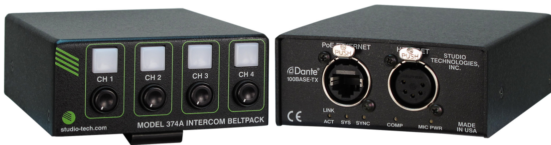
Figure 1. Model 374A Intercom Beltpack top and bottom views

The STcontroller software application is used to select the unit's operating parameters. Four talk pushbutton switches can be configured for optimal operation. Four push-in/push-out (“pop out”) rotary controls make it easy to set and maintain the desired headphone output level. The Model 374A's enclosure is made from an aluminum alloy which offers both light weight and ruggedness. A stainless steel “belt clip,” located on the back of the unit, allows direct attachment to a user's clothing.