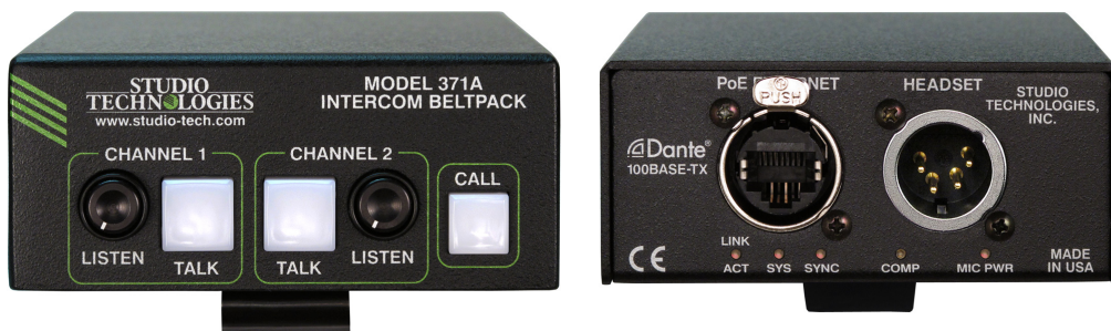
Figure 1. Model 371A Intercom Beltpack top and bottom views

The audio quality of the Model 371A’s audio channels is excellent, with low distortion, low noise, and high headroom. Careful circuit design and rugged components ensure long, reliable operation. A wide range of applications can be supported, including theater facilities, over-the-air and streaming broadcasting,