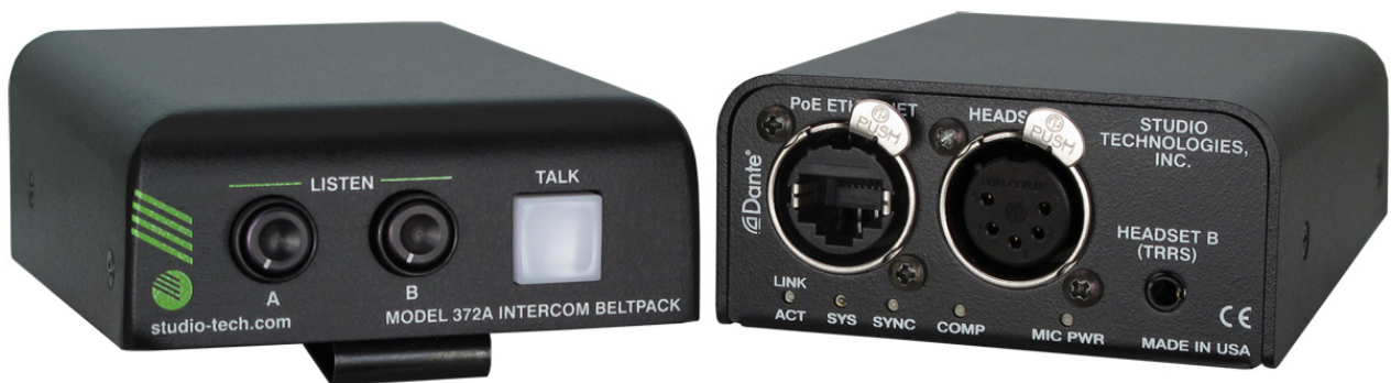
Figure 1. Model 372A Intercom Beltpack top and bottom views

Setting up and configuring a Model 372A is simple. An etherCON® RJ45 receptacle is used to interconnect with a standard twisted-pair Ethernet port associated with a local-area network (LAN). This connection provides both power and bidirectional digital audio. The Model 372A is compatible with both broadcast and "gaming" headsets.