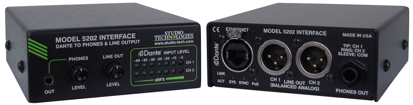
Figure 1. Model 5202 Dante to Phones and Line Output Interface front and rear views

A sonically-excellent 2-channel (stereo) headphone output is provided. It is capable of driving contemporary headphones, headsets, and earbuds to substantial levels at very low distortion. A rotary control is used to adjust the headphone output level. The level knob is a push-in/push-out type which helps prevent inadvertent adjustment. For flexibility the headphone output is provided on two separate 3-conductor jacks: a 3.5 mm on the front panel and a 1/4-inch on the back. The audio quality of the headphone output is such that it can also be used as a 2-channel unbalanced line output. The output level control will make it a simple task to optimally interface the headphone output with inputs on personal computers, portable audio devices, and "semi-pro" equipment.