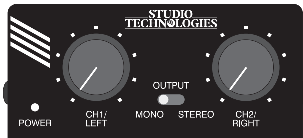
Power present LED | Channel 1/ Left Output Level | Mono/Stereo output mode | Channel 2/ Right Output Level