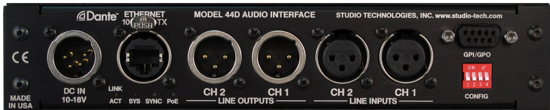
“Original” Model 44D back panel with serial numbers 00151-00250 (upper); “Updated” Model 44D back panel with serial numbers 01151-later (lower)