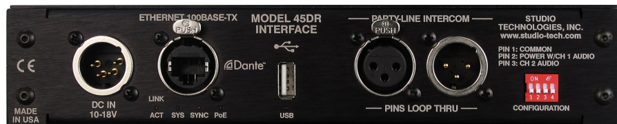
Figure 2. Model 45DR back view