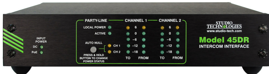
Figure 1. Model 45DR standard “throw-down” front view

A Model 45DR can interconnect with devices such as matrix intercom systems, DSP processors, and audio consoles. The Model 45DR is directly compatible with the RTS ADAM® OMNEO® matrix intercom network. Alternately, two Model 45DR units can interconnect by way of the associated Ethernet network. The Model 45DR can be powered by Power-over-Ethernet (PoE) or an external source of 12 volts DC. A party-line power source and impedance termination networks can be supplied by the Model 45DR, allowing connection of user belt packs such as the popular RTS BP-325. A Model 45DR can also connect with an existing powered and terminated intercom circuit. Audio level meters provide confirmation of system performance